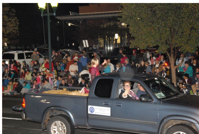
Club members march and ride in the annual Halloween Parade